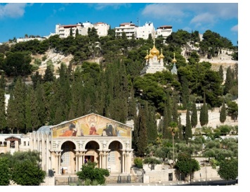
Mt. Of Olives