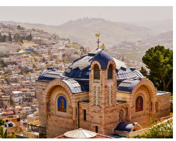
St. Peter in Gallicantu