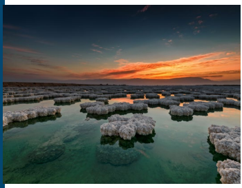
The Dead Sea